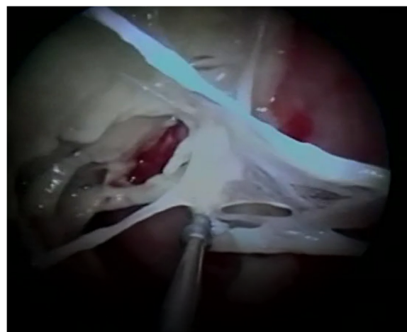
Fig. 1 Biopsy forceps used to cut intrapleural adhesions

The etiology of empyema was complicated parapneumonic effusion in 25 patients (67.5%), tuberculosis in 10 patients (27.02%), and malignancy in 2 patients (5.40%)