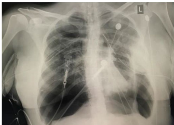
Fig. 1 Eric Williams Medical Sciences Complex for thoracic surgical management of bilateral spontaneous pneumothoraces and a left-sided hydrothorax