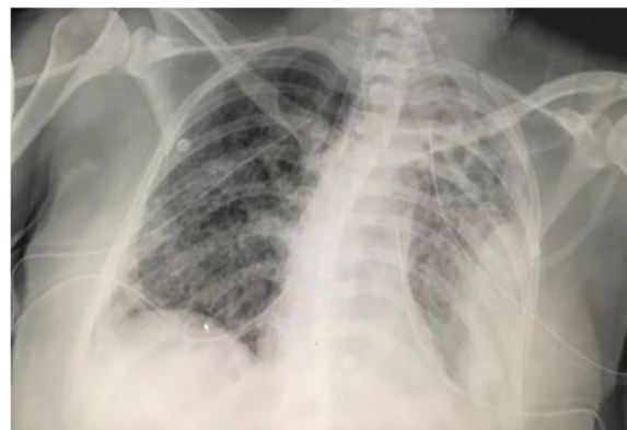
Fig. 3 Diagnostic/investigations