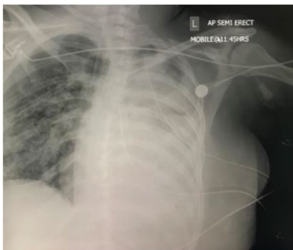
Fig. 2 Left main bronchus completely occluded with clots which were removed