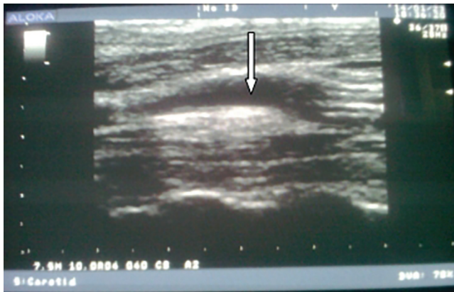
Gray-scale assessment of CIMT demonstrating the increased thickening of the wall with the presence of a carotid plaque (white arrow). CIMT, carotid intima-media thickness.