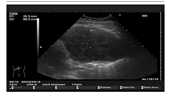
Ultrasound-guided biopsy was taken and sent for histopathological examination, which revealed Hodgkin's lymphoma.