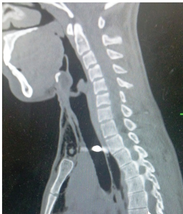
Computed tomographic scan of the neck showing bullet in the lateral wall of the trachea.

The patient was found to have bullet in the right chest, which he spontaneously expectorated after more than 4 months [3]. Andrews and colleagues described a case in which the bullet was found on chest radiograph to be adjacent to the right main bronchus. On the way to the operating room for bronchoscopy, the patient coughed and expectorated the bullet [4]. A similar case was published by Rhodes and Gupta [2] in which the patient had expectorated the bullet while the patient was being taken for bronchoscopy. Hesami and Johari [5] reported a case of a bullet lodged near the tracheal bifurcation. This patient, although stable at presentation, did have a hemopneumothorax and tube thoracostomy was performed. The patient recovered well and was discharged home with the bullet still in place. Three months after the injury, the patient experienced a bout of coughing and expectorated the bullet.