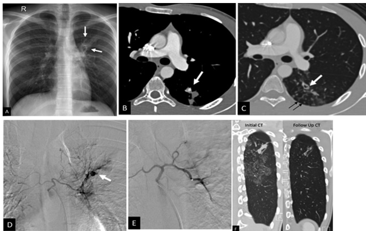
A 17-year-old man with hemoptysis. (a) Plain radiograph shows left para-hilar reticulonodular density and ill-defined opacity. (b) CTA in the mediastinal window shows a small aneurysm (arrow) in the apical segment of the left lower lobe in addition to a cavitary lesion (arrow) and tree in bud nodules (small black arrows) in (c). (d) selective bronchial angiography shows the common origin of the right and left bronchial arteries, attenuated right artery, abnormal left bronchial branches, and a small pseudoaneurysm (arrow). (e) Cessation of flow to the pathological arteries after embolization with 150–250 \mu polyvinyl alcohol particles. (f) follow-up computed tomography in 3 months shows marked improvement and disappearance of the aneurysm. Patient did not have another attack since embolization. CTA, CT pulmonary angiography.