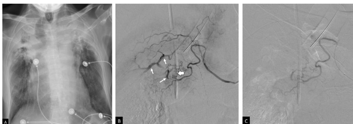
A 60-year-old man with hemoptysis. (a) Chest radiograph shows bilateral apical destructive lung changes with pleural thickening and traction on the trachea. Endoscopy confirmed bleeding from the right side. (b) Right ICBT catheterization with a 5 Fr cobra 1 catheter shows pathological vessels (white arrows) in the upper lobe with a bronchial–pulmonary shunt (block arrow). (c) Postembolization with 150–250 \mu polyvinyl alcohol particles using a microcatheter. ICBT, intercostal-bronchial artery trunk.

like this study as fiberoptic bronchoscopy (FOB) determined the origin hemoptysis in some cases that were not determined by imaging neither by chest X ray nor CT pulmonary angiography. Remy et al. [25] performed BAE for control of hemoptysis for the first time in 1973. Multiple studies reported the