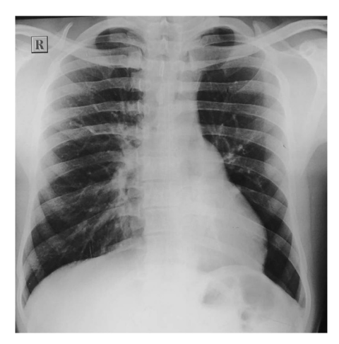
Chest X-ray Showing lung hyperlucency.

management of any infection. The patient was also advised pneumococcal and annual influenza vaccinations. The patient improved with conservative management and is on regular follow-up.