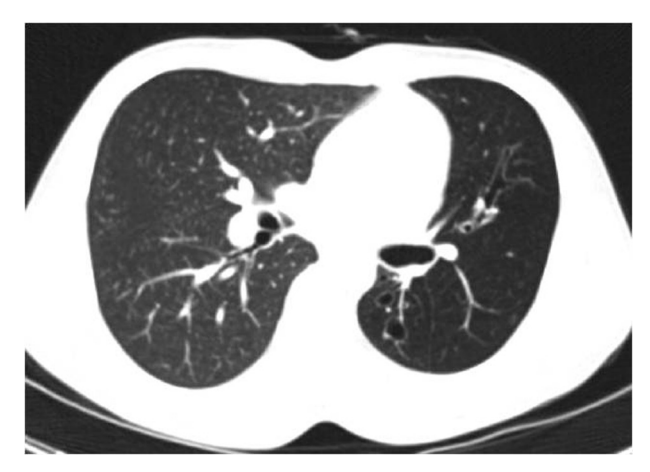
CT Scan showing left sided hyperlucency with presence of bronchiectasis.