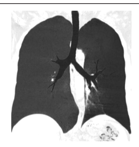
Virtual bronchoscopy showing slight narrowing of the left main bronchus without any luminal compromise.

architecture leading to secondary pulmonary artery hypoplasia. Alternatively, it is thought that primary pulmonary arterial abnormality predisposes the patient to respiratory tract infection and subsequent airway/alveolar changes. Pathologically, bronchiolitis obliterans can be appreciated in the affected lung.