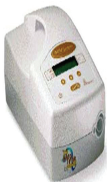
First generation BiPAP.