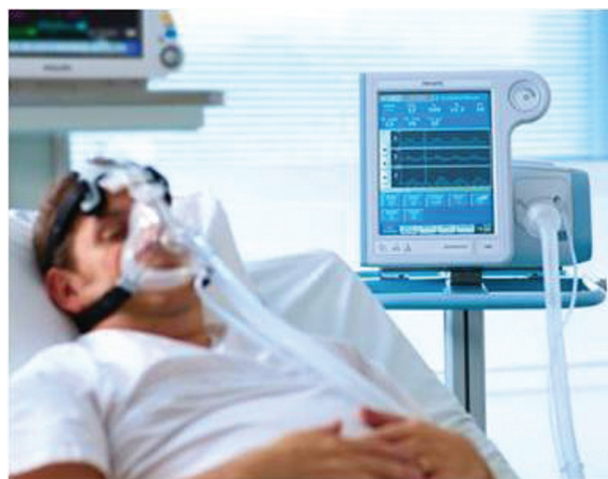
V60 with AVAPS.

with neuromuscular problems do better with lower inspiratory flow (i.e. pressure rise time of 0.05–0.2 and 0.4–0.5 s, respectively).