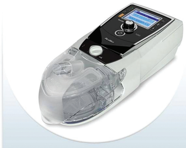
Second generation BiPAP. Stellar.

default or changeable percentage (usually 25%) of inspiratory peak flow.