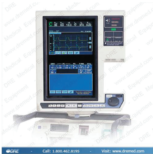
Purittan Benett 840.