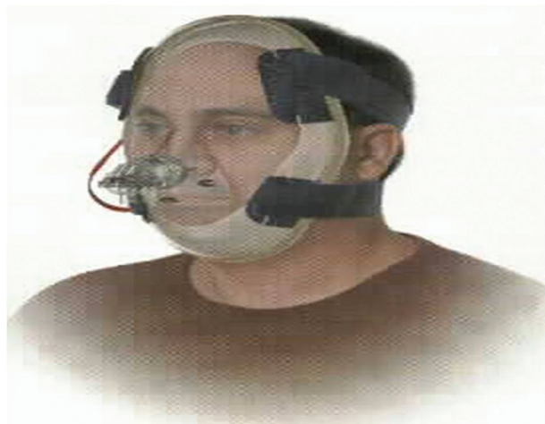
Total face mask (TFM).