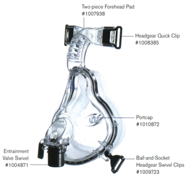
Comfort full oronasal mask.