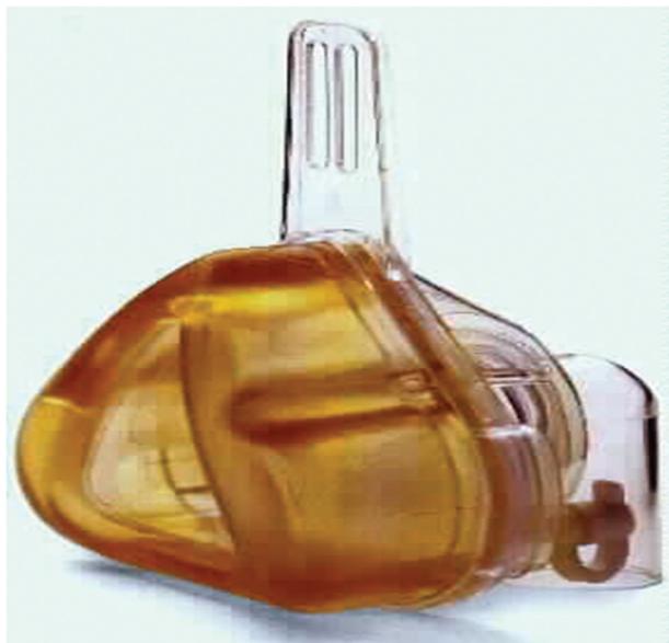
Standard nasal mask.