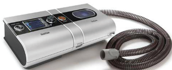
Second generation BiPAP. VPAP/ST.